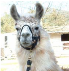
Even the llamas are anxious to get out and do some exploring after this winter is finally over!